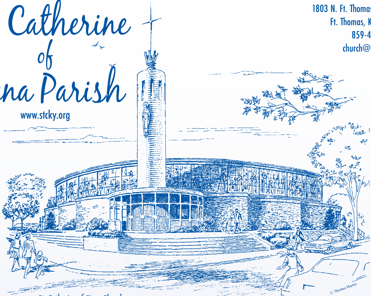
St. Catherine of Siena Church • FORT THOMAS, KENTUCKY

1803 N. Ft. Thomas Avenue Ft. Thomas, KY 41075 859-441-1352 church@stcky.org