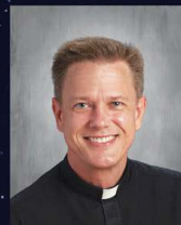
A free will offering will be accepted

THE EUCHARIST: A MYSTERY YOU CAN'T SWALLOW WHOLE