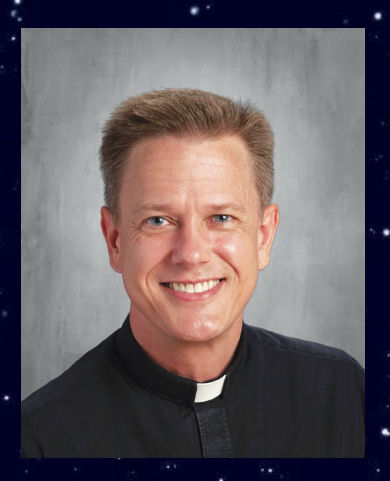
A free will offering will be accepted

THE EUCHARIST: A MYSTERY YOU CAN'T SWALLOW WHOLE